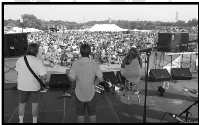
View From the Stage