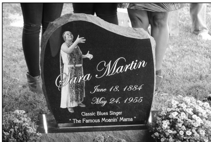
A fitting tribute to one of our own