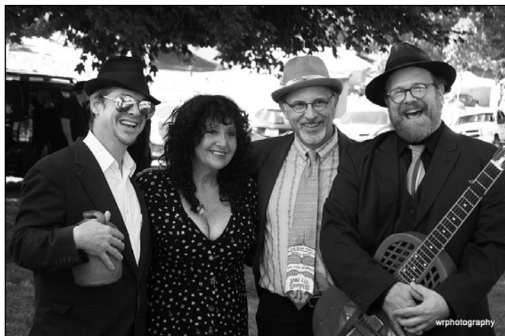
Maria Muldaur with the Jake Leg Stompers