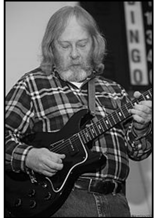
The Saints.