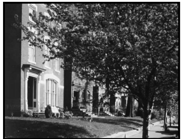
Mayor Fischer and friends, juggler, and historic homes