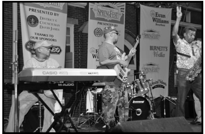
Booths at the first annual Old Louisville Springfest, (L) , and music by Walnut Street Blues Band (R)