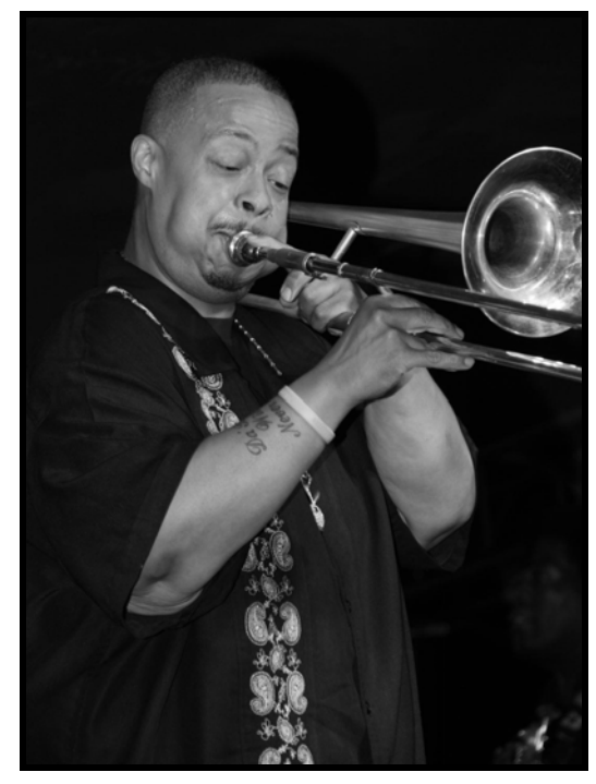
Big James and the Chicago Playboys closed out the festivities Saturday night at the Water Tower.