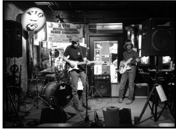
Rolling Rivers Blues Band