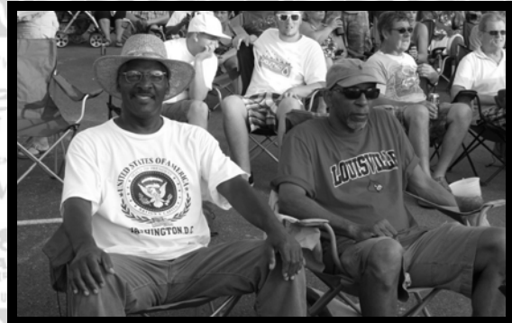
Braving the heat