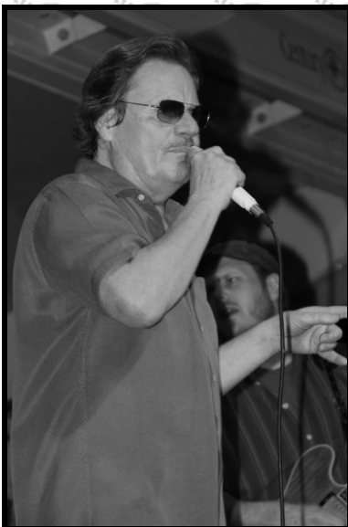
Delbert McClinton