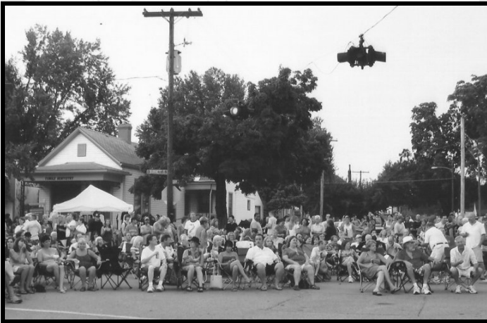
Appreciative Fans