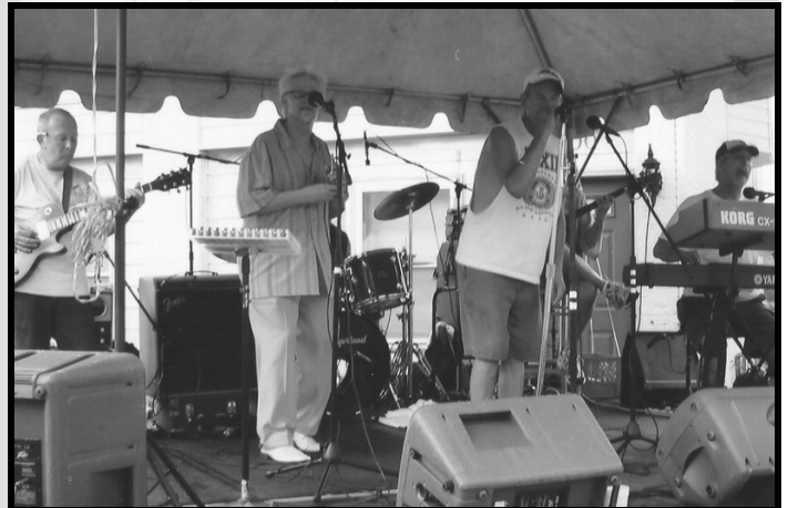
The Saints