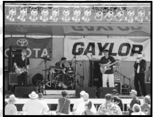
Big Al & The Heavyweights