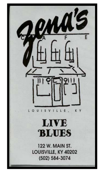
KBS members get $1 off admission Fridays and Saturdays with your current membership card.