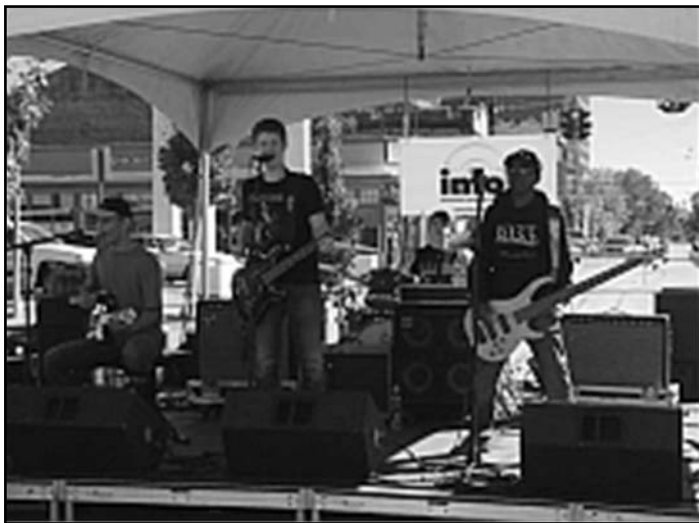
MOM's School of Rock Band