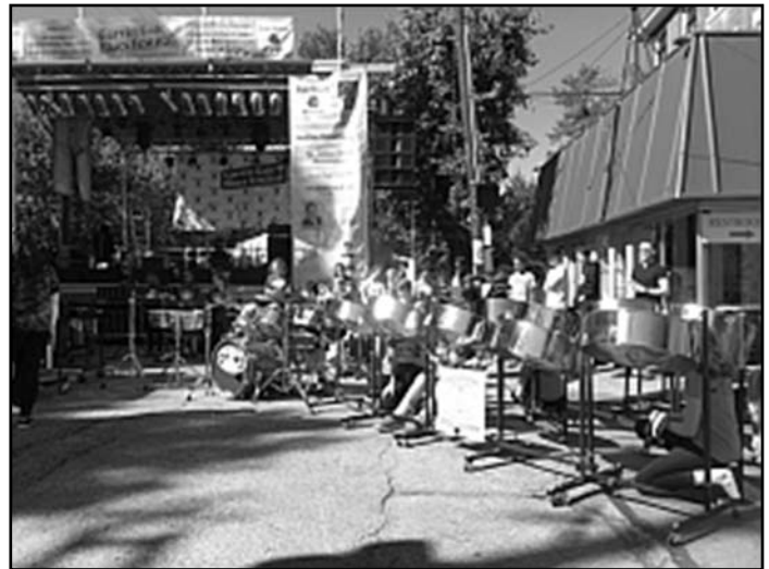
Louisville Leopards Percussionists

In finalizing this report on both the Blues in the School and Blues for Youth programs, I would again like to convey my gratitude to everyone that was involved this year. This includes the schools, the principals, the teachers, some of the most well-behaved students I ever saw, the volunteers, the parents who support music, and everyone else I mentioned previously. Being able to help with these programs was one of the most rewarding things I have ever done. These programs are definitely one of the best ways we can preserve, promote and perpetuate the blues tradition.