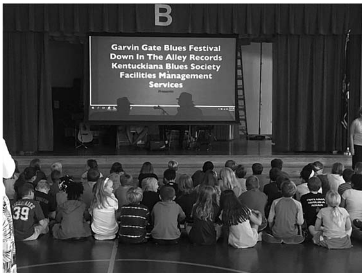
Bloom Elementary Students

Preserve, promote and perpetuate the blues tradition; we do this in a variety of ways. The generous support that blues societies, and our own KBS specifically, provide for musicians playing the blues genre of music can be seen every year at festivals like Ribberfest and Garvin Gate Blues Festival . Maybe we are just old-school and still like to read the liner notes and like the actual CD. And, man do I love a good XL t-shirt in black.