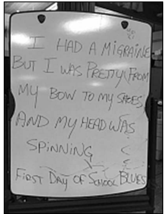
Out of the mouths of babes...