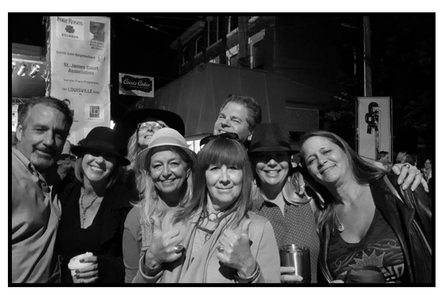
KBS members/Garvin Gate fans!