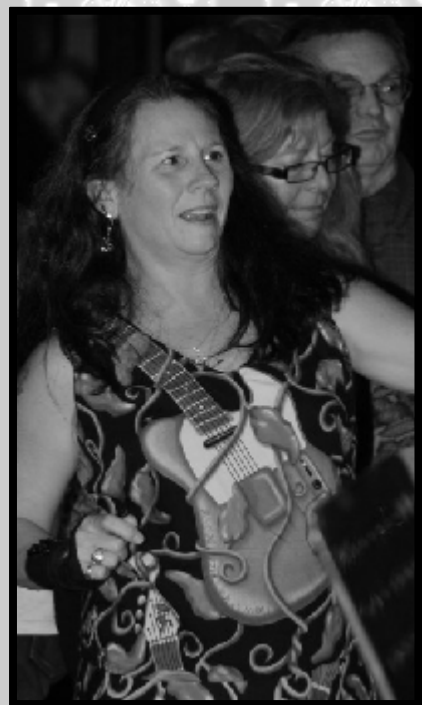
Best Dressed