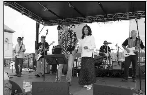
Jaywalkers at Louisville Blues & BBQ