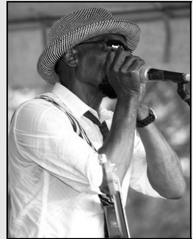
Joe Debow at Germantown – Schnitzelburg Blues Festival