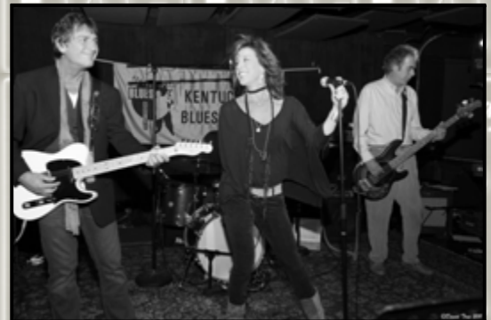
2011 KBS/IBC Band Contest Winners Little T&A