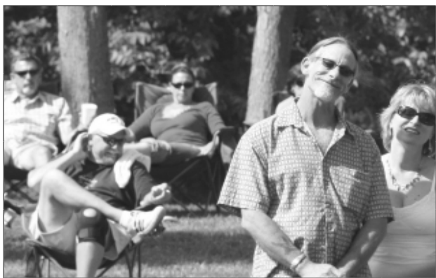
Enjoying the Show