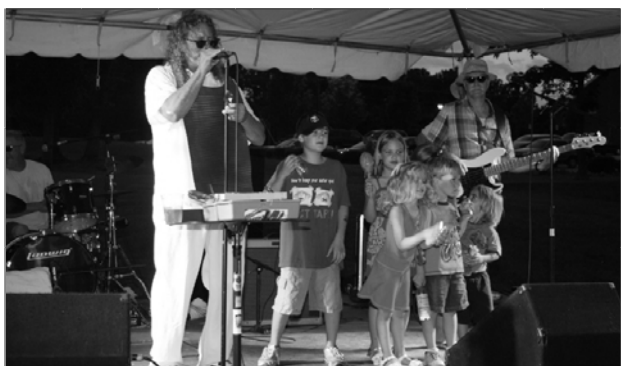
Travlin'Mojos and mini-Mojoettes