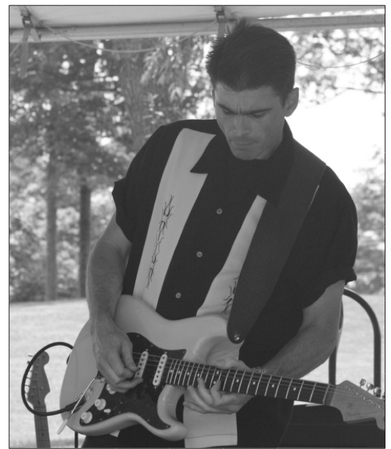
Guitarist from 155