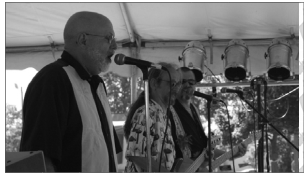
Clay Street Blues All Stars