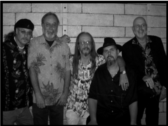
Photo Courtesy of Clay St Blues All Stars Clay Street Blues All Stars