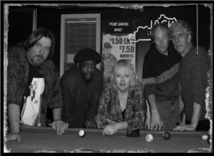
Pure Gravel Blues Band

Shown below are just a few of the great LOCAL blues bands currently playing in the Louisville area. If you haven't seen ALL of these, you're missing out. Check out the calendar on page 11 and our website at www.kbsblues.org and GET OUT THERE! Note to performers: In addition to your upcoming events for the calendar, send us your pictures! Help us promote Louisville blues! Snail mail to KBS, PO Box 755, Louisville, KY 40201 or email to news@kbsblues.org .