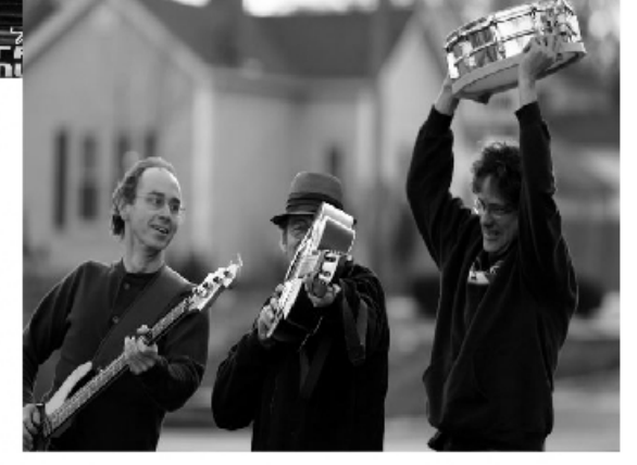
Mad Dog Rhythm & Blues Quartet

Admission Only $5 Raffle held for T-shirts, CD's and more more info at kbsblues.org or Call 724-9971