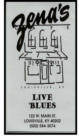
KBS members get $1 off admission Fridays and Saturdays with your current membership card.